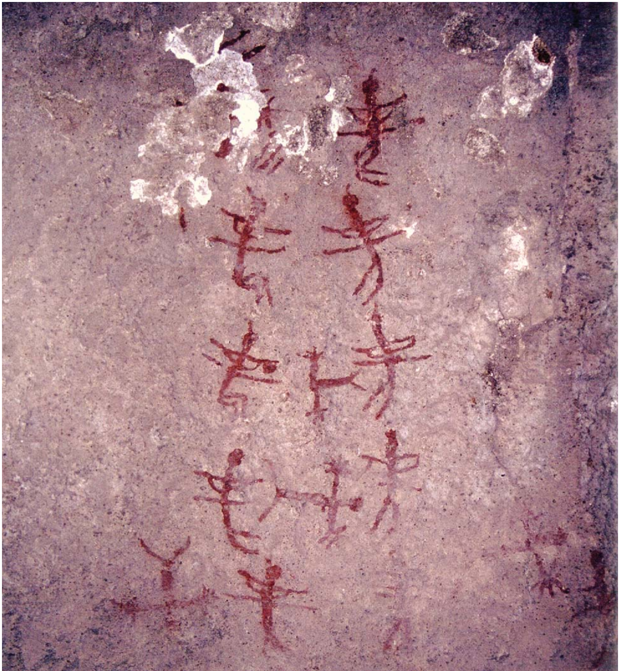
Small anthropomorphs, Oqhotera site, at 4400 m altitude, Tantamaco Community, Macusani district, Peru. One of over 200 sites under threat of destruction. (See article by R. Hostnig, pp. 229–233.)