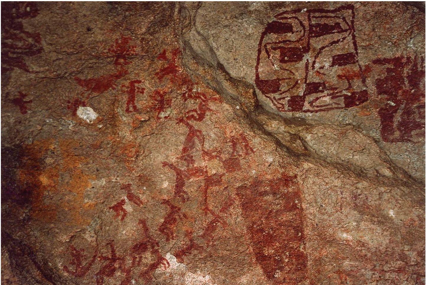
Camelids and compositions called mantas (textiles). Detail of a panel in the Oqhoruni shelter, 4450 m altitude, Isivilla community, Corani district, Peru. (See article by R. Hostnig, pp. 229–233.)